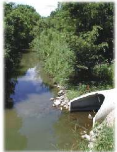
Storm sewer outlet into Oak Creek

Fecal coliform and E. coli bacteria survival is dependent on specific environmental conditions that are highly variable and change quickly. This makes predicting bacteria populations within the waterways difficult. For example, although spring rains may wash more fecal matter into the waterway, cool water temperatures may prevent them from flourishing. During the summertime, increased exposure to sunlight (with its ultraviolet disinfection properties) may limit bacterial numbers even though warmer water temperatures exist.